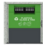
Plastics, Glass & Tins Restricted Opening