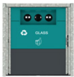
Glass - Hole