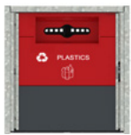
Plastics - Mixed