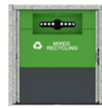
Mixed Recycling Individual Item