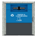
Paper and Cardboard Individual Item - Mixed