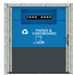
Paper and Cardboard Individual Item - Slot