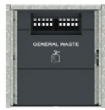
General Waste Restricted Opening