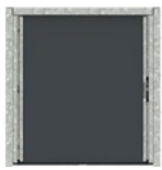
Solid Door No Aperture