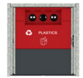
Plastics - Hole