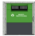
Mixed Recycling Restricted Opening