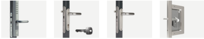
Latch + Battery Code Lock